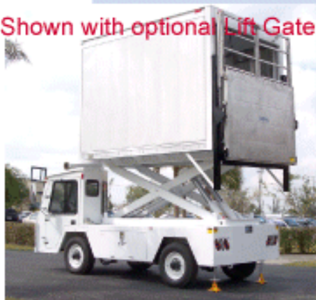
Shown with optional Lift Gate